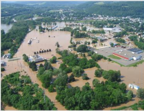
Village of Owego During the June 2006 Flood.

The Tioga County Flood Mitigation Group received a grant award from FEMA to provide education opportunities for local officials in relation to flooding events. Since the 2006 flood events the County Flood Mitigation Group has been working to update the County All Hazards Mitigation Plan in relation to flood projects and issues and has secured funding to complete an education