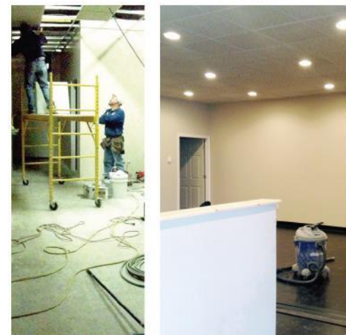
IDA funds assisting in expansion and renovation. Stiletto's Hair and Nails also used IDA funds to enable the purchase of new equipment, allowing their service offering to expand into a full service salon.

$150 Non-Refundable Application Fee, 1% Service Fee and Loan Closing Costs.