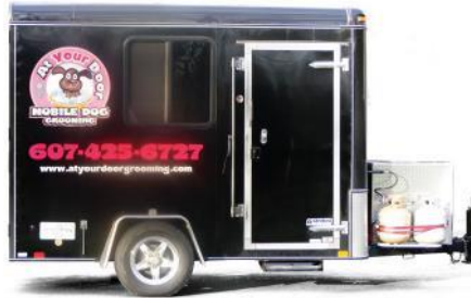
At Your Door Mobile Dog Grooming, mobile unit

GRANITE WORKS used IDA funds to invest in technologies to both benefit it's business and employees.