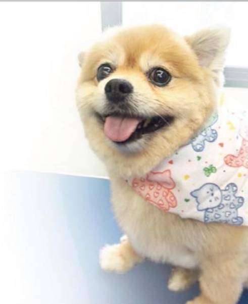
At Your Door Mobile Dog Grooming, happy canine customer