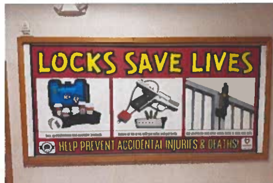
Bulletin Boards: Health & Human Services Building-May 2025